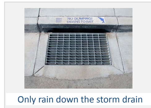
Only rain down the storm drain

Help protect the Bay and local creeks by following these guidelines.